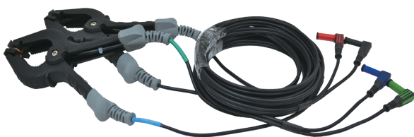
AL-34WB 10A 3M