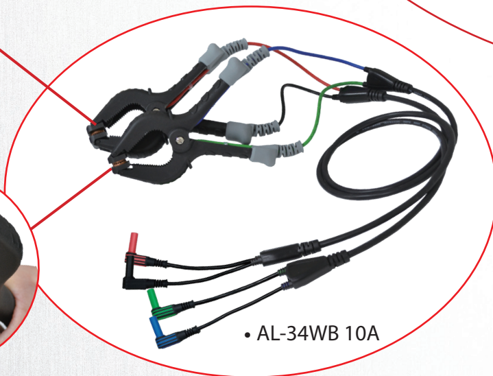
• AL-34WB 10A