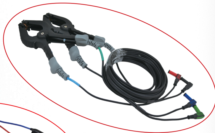
• AL-34WB 10A 3M