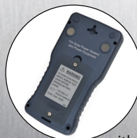
with magnets 8002A DM