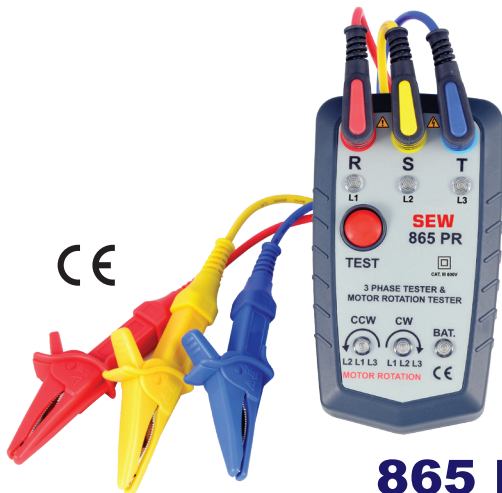
865 PR LED Indication