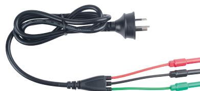
TEL_EL (Optional) (For 1812 EL-A, 1813 EL-A)