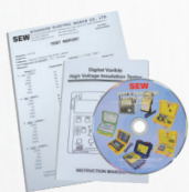
Test report Instruction manual CD or USB(optional)