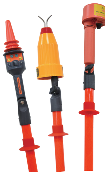
Attached to the High Voltage Proximity Detectors and Contact Capacitive Detectors