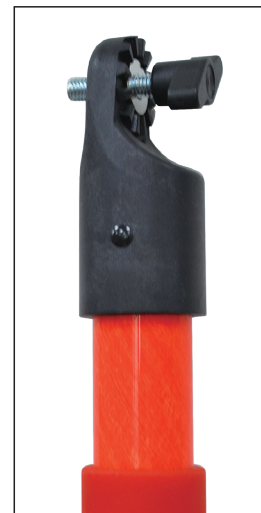
Universal Sunrise Fitting head