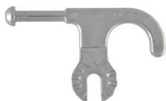
HOK-HS166 Disconnect hook (optional)